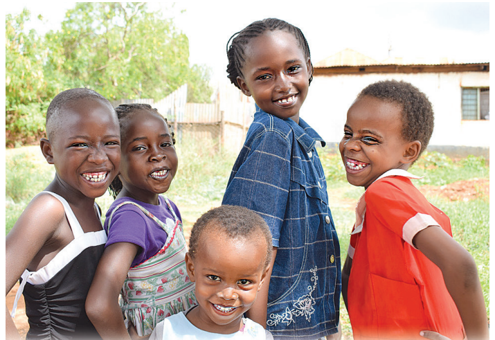
Children who listen in the studio to the Swahili program and discuss the story.

After the English broadcast, children retell the story on air in Chichewa, the local language.